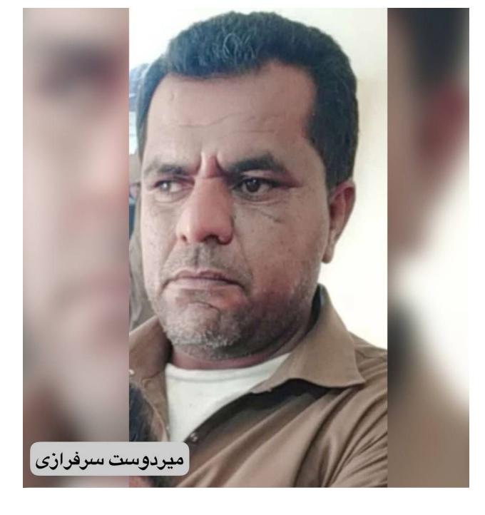
Killing and illegal shooting of Baloch citizens by the military forces of Islamic Republic of Iran